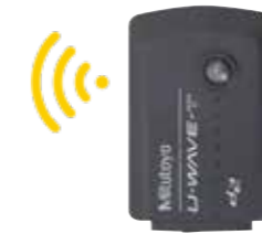
Code No. 02AZD880G U-WAVE-T