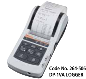
Code No. 264-506* DP-1VA LOGGER

Cables Code No. 06AFZ050 USB cable (Type A - micro B)