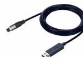
USB Direct Input Tool Code No. 06AFM380E USB-ITN-E