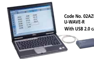
Code No. 02AZD810D U-WAVE-R With USB 2.0 cable (1 m)