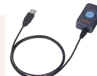
USB keyboard signal converter type* Code No. 264-020 IT-020U * One of the cables below (sold separately) is required to connect the testing machine to the IT-020U. 1 m: Code No. 937387 2 m: Code No. 965013